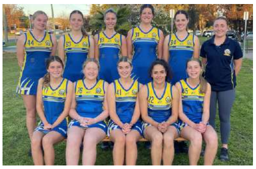
COACHES MESSAGE -I would firstly like to say a big congratulations girls, with 4 out of 5 teams making the finals. I wish all teams the very best.