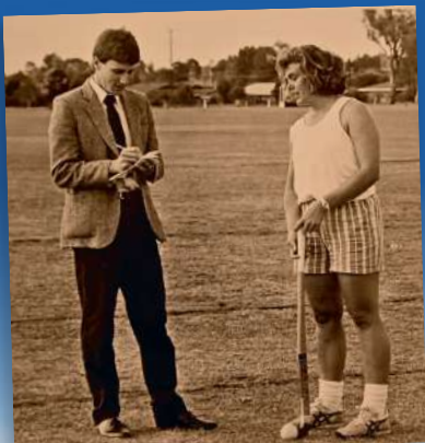
FLASHBACK: Interviewing a young hockey player as a cadet reporter with The Daily Advertiser in the 1980s.

Supporting local sport for more than 40 years ... as a journalist, in business and now as your strong, local voice in Federal Parliament.