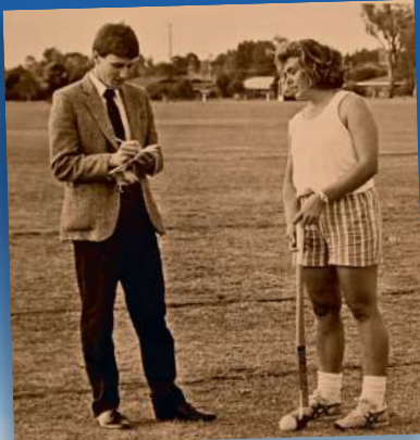
FLASHBACK: Interviewing a young hockey player as a cadet reporter with The Daily Advertiser in the 1980s.

Supporting local sport for more than 40 years ... as a journalist, in business and now as your strong, local voice in Federal Parliament.