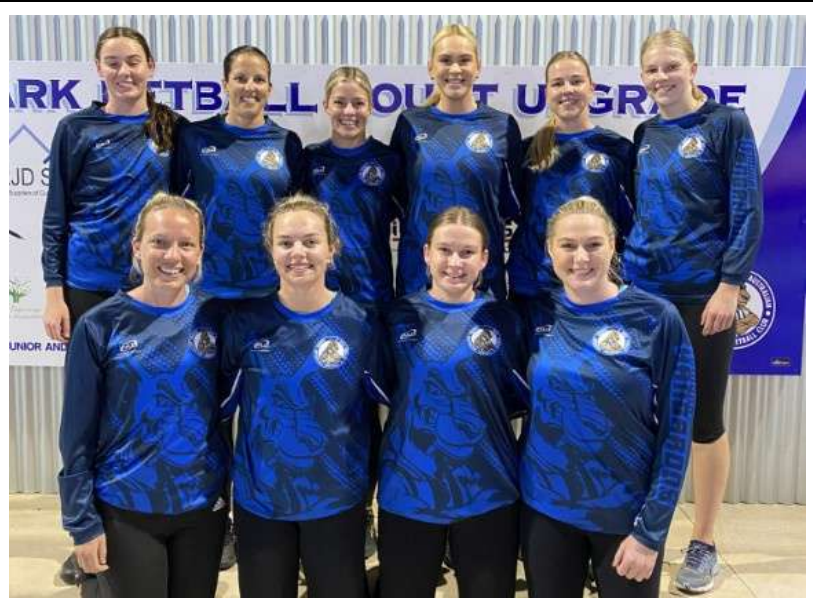
'Let's go Rooettes!! Chase that premiership flag home!'

This year has been a very successful one for "The Roos" with 6/8 Football and Netball teams making the finals series and 3 Netball teams progressing to the Grand Final. This is an absolute credit to everyone involved. The dub is in a great position with a strong development base and some talented players making their way through the U17s and U18s teams. We had more than a handful of players debut for first grade football and A grade netball this year and they should be proud of the contribution they made on the court and field.