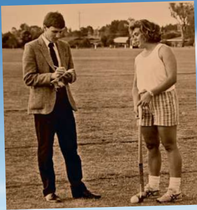
FLASHBACK: Interviewing a young hockey player as a cadet reporter with The Daily Advertiser in the 1980s.

Supporting sport for more than 40 years ... as a LOCAL journalist, in business and now as your strong, local VOICE in Federal Parliament.